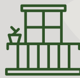
Large ventilated balconies