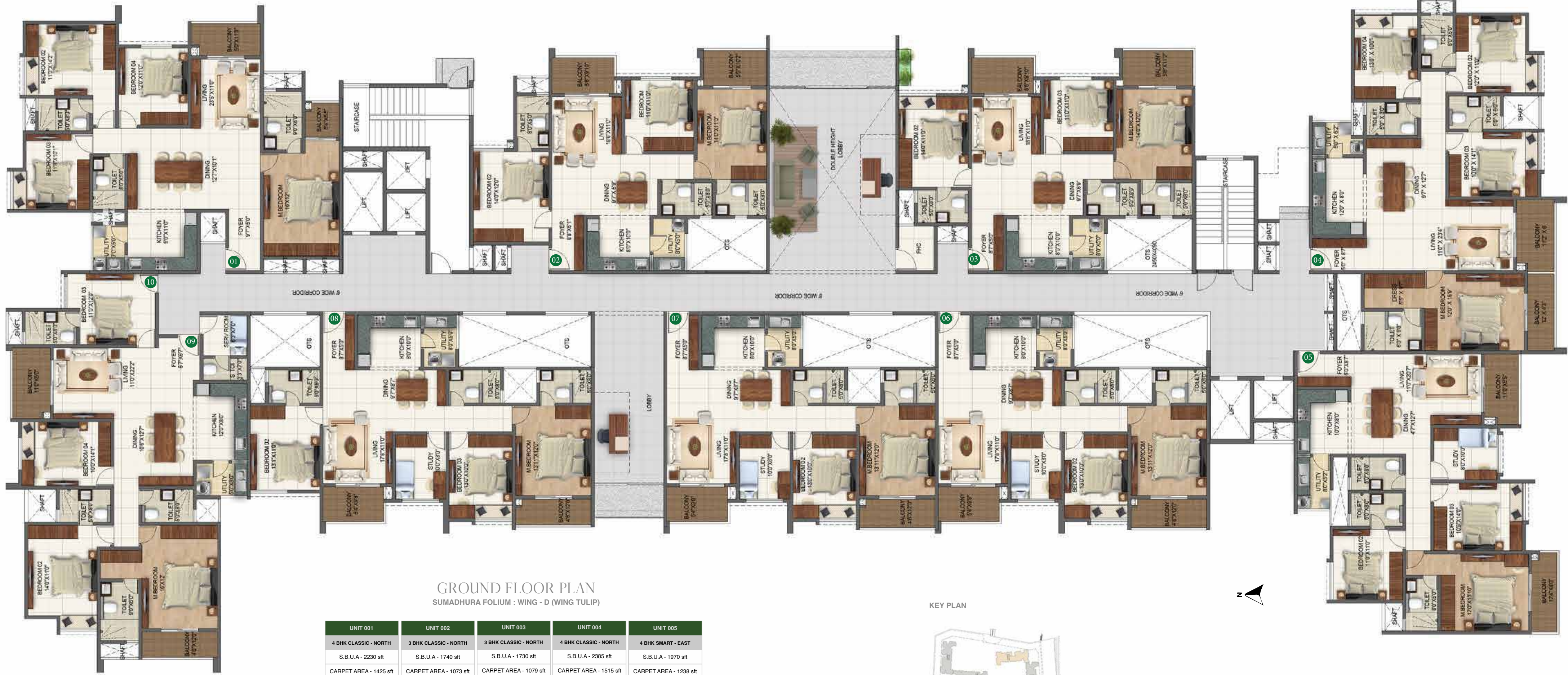
GROUND FLOOR PLAN SUMADHURA FOLIUM : WING - D (WING TULIP)