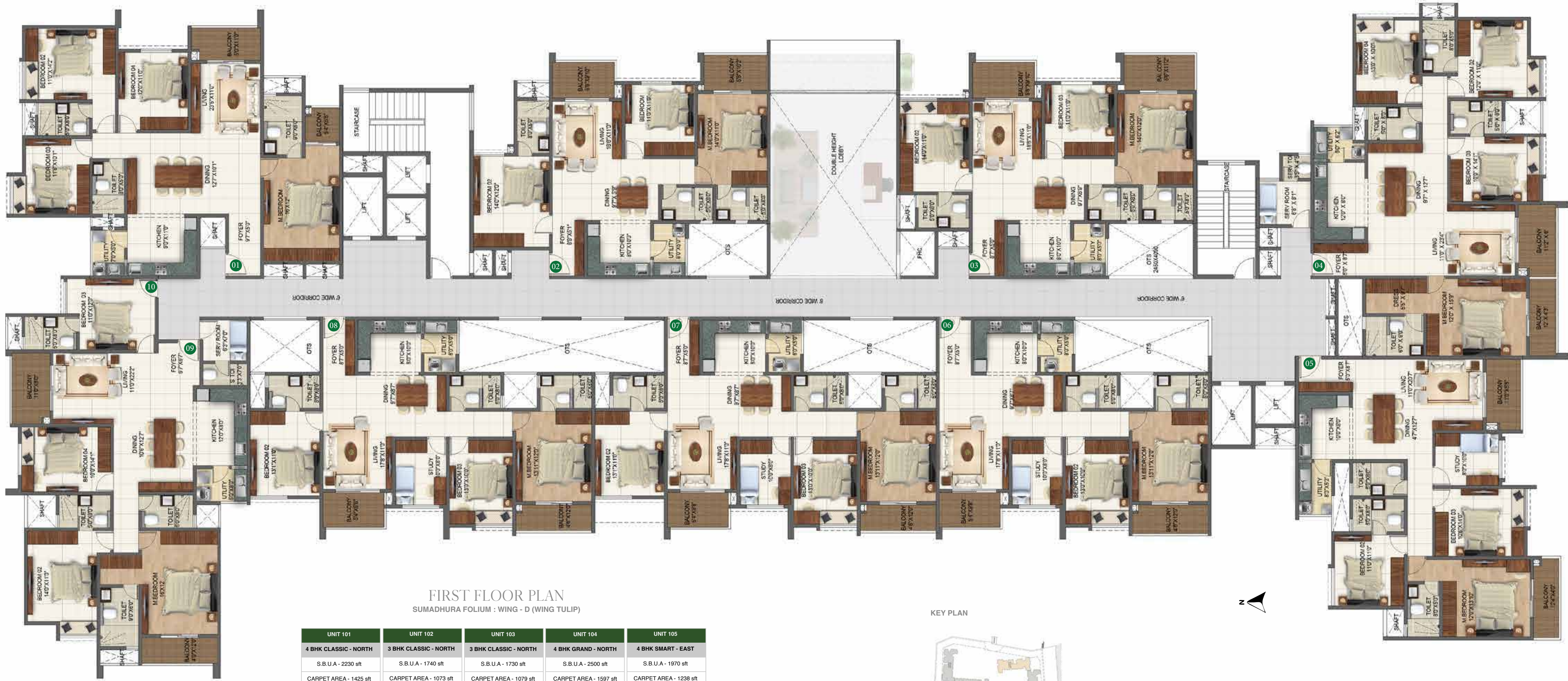
FIRST FLOOR PLAN SUMADHURA FOLIUM : WING - D (WING TULIP)